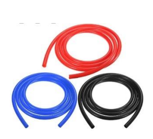
HIGH PRESSURE TUBES