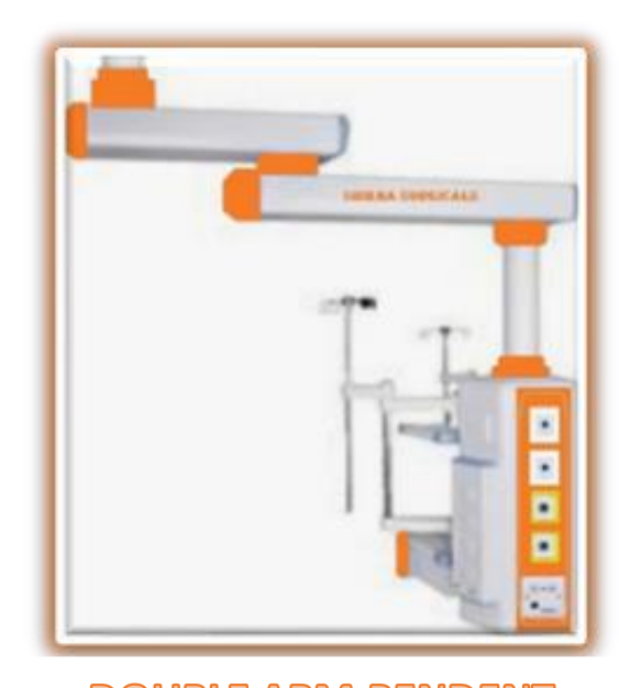
DOUBLE ARM PENDENT