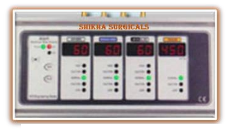
DIGITAL ALARM PANEL