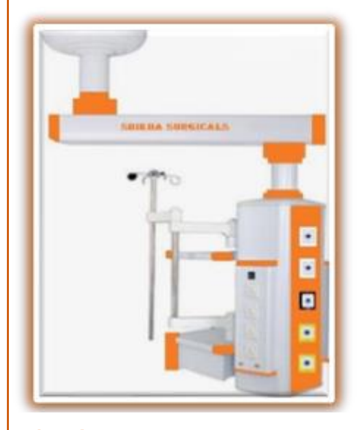
SINGLE ARM PENDENT