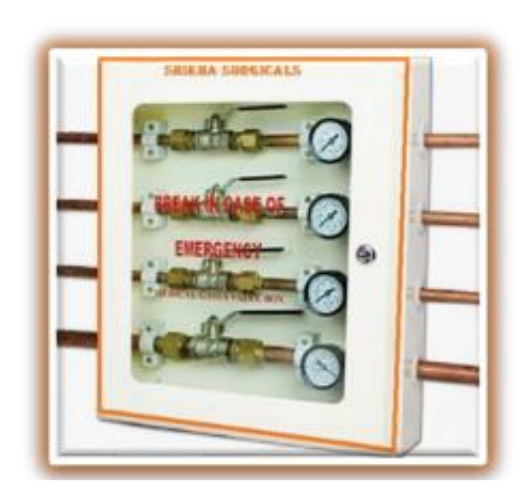
AREA VALVE BOX