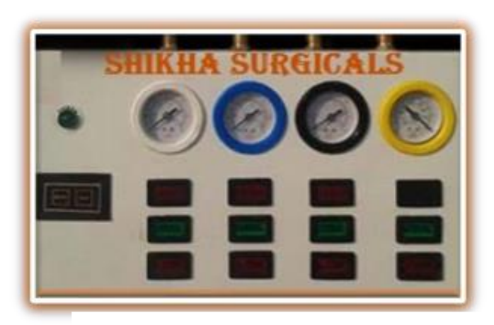
AREA ALARM PANEL