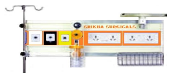
BED HEAD PANEL-2