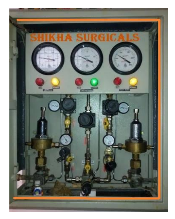
OXIGEN CONTROL PANEL